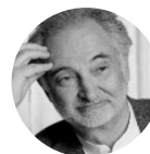
Jacques Attali Founder & head of A&A