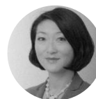
Fleur Pellerin Founding Partner, Korelya Capital