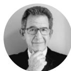
Lord Browne of Madingley Chairman of the Advisory Council Former CEO of BP Group