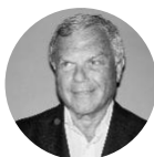
Sir Martin Sorrell Executive Chairman & founder, S4 Capital